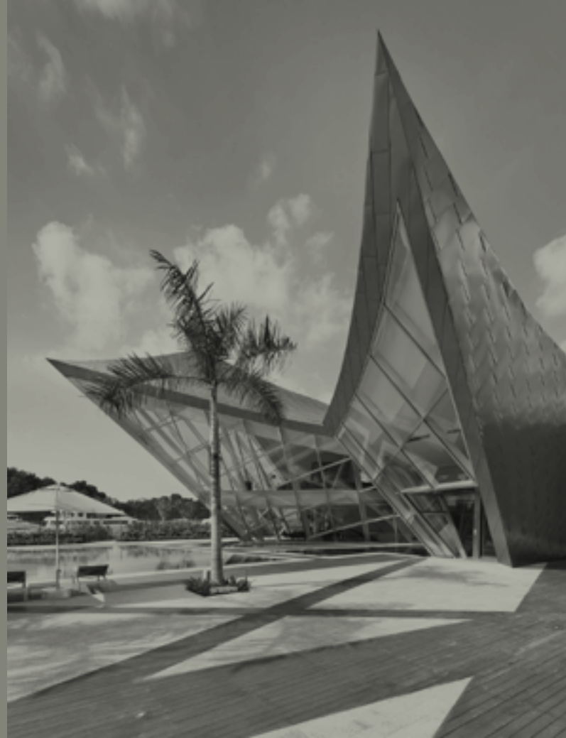
THE REFLECTIONS CLUB HOUSE | KEPPEL BAY - SINGAPORE